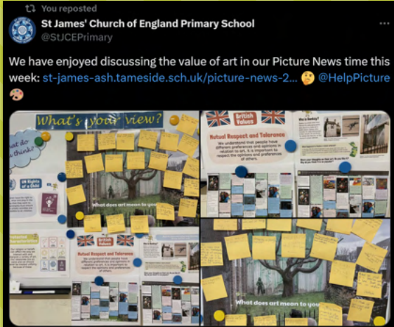
St James' Church of England Primary School

Our schools have been busy exploring their weekly news packs. Here's some recent impressive news-based work!