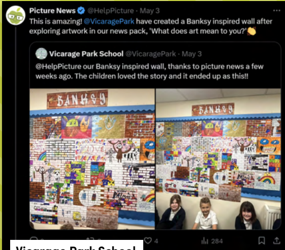
Vicarage Park School